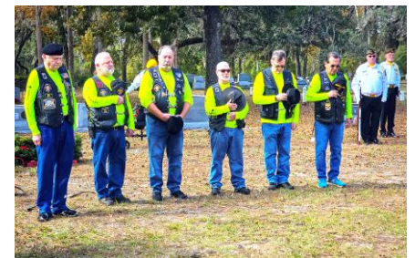
ALR members at Espanola Cemetery