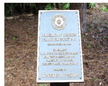
AMERICAN LEGION POST 115 PLAQUE @ PALM COAST HEROES PARK