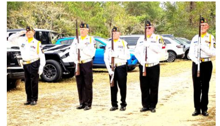
Post 115 Color Guard at the Masonic Cemetery WAA Ceremony

The Color Guard led the parade on Veterans Day in Bunnell, FL, Nov. 11 and honored victims who perished on 9/11 at the ELKs Club.